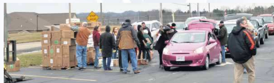
Many lending hands and many appreciative residents! An incredible day in New Lexington!